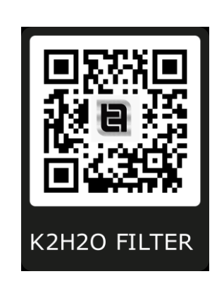
Scan for help with installation